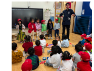
3:00 pm Parent Pickup