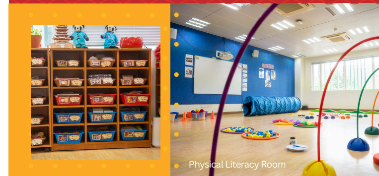
Physical Literacy Room