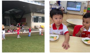
Specialist PE (SK) Snack Time