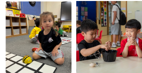
Learning Centres, STEAM activities, Physical Literacy