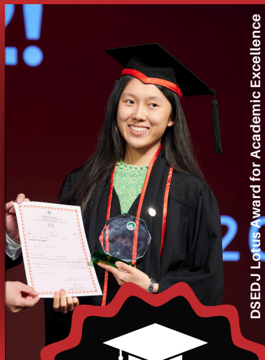
DSEDJ Lotus Award for Academic Excellence